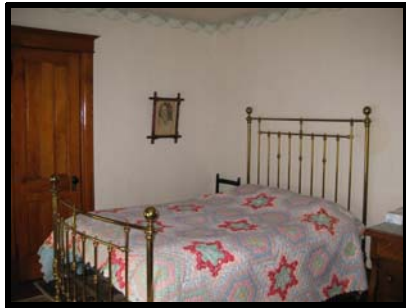
4 - 2nd level bedrooms