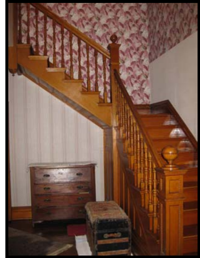
Large open stairway