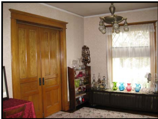
Several sets of "pocket doors"